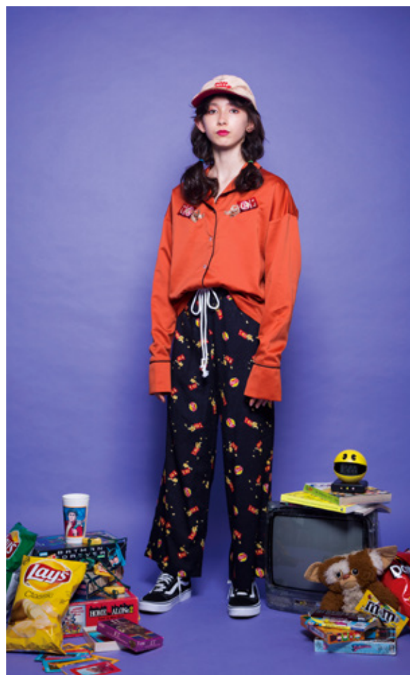
JAPAN - Batty Garage by Aymmys hall 3 – Stand 141 -159

If you're a lover of fine jewellery, head to the "Mishell" Showroom, home to our Korean jewellery collection. Over a space of 130m 2 , 16 designers will present their most beautiful creations, ranging from traditional pieces to more innovative ones. From classical-inspired necklaces set with precious stones, to fantasy-esque modern pieces, there's something for all tastes and styles.