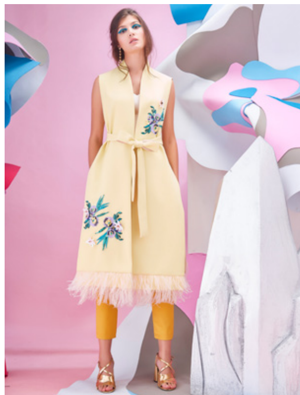
THAILAND - Karima Bi Hall 3 - facing the start-up village/Fashion Solutions

Dive into the bold world of Taiwanese fashion with 6 young ready-to-wear and accessory designers. With the support of the Taiwan Textile Federation and export-support associations, these designers unveil their dazzling and original collections at their individual stands at the trade show