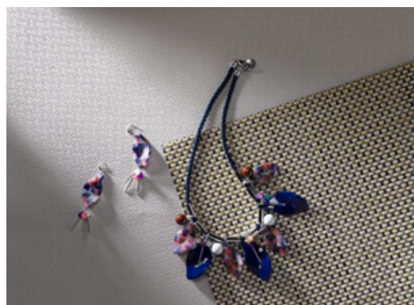
KOREA - Aznavour . Grain de Beauté hall 3 – facing Fashion Solutions Stands